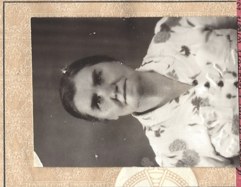
WIFE — FEMME